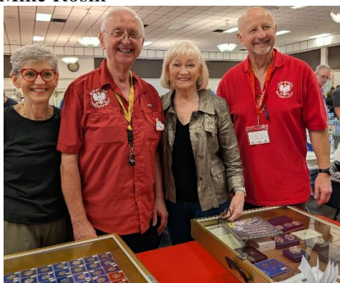
Above and below, something for kids of all ages.