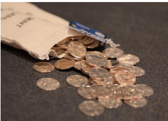
As much fun as pirate treasure?