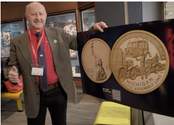
One glorious moment with big money