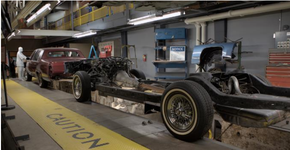
Inside the Detroit Historical Museum